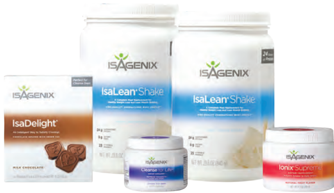
Healthy Lifestyle Pak